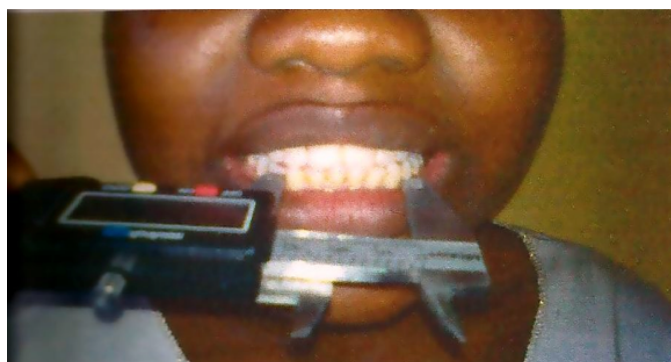
Figure 2: Photograph showing the measurement of the mandibular inter canine arch width.

The upper lip length of the subjects was measured using the measuring tape. The subjects were instructed to position their