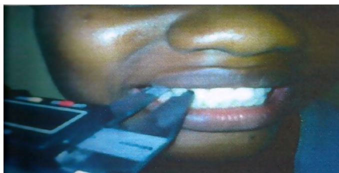
Figure 2: Photograph showing the measurement of the maxillary mesiodistal canine width.

value were reported as females. However, those values above this limit were reported as males.